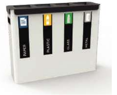
MAKİ 80 Four Compartment Metal Waste Bin Material: Electrostatic Painted Metal Capacity: 120 Lt Capacity with Inner Bucket: 80 Lt Width x Depth x Height 82 x 23 x 68 cm