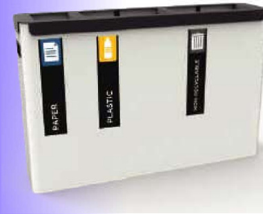
MAKİ 100 Three Compartment Metal Waste Bin Material: Electrostatic Painted Metal Capacity: 125 Lt Capacity with Inner Bucket: 100 Lt Width x Depth x Height 101 x 23 x 68 cm