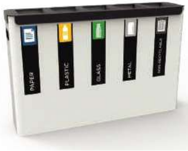
MAKİ 100 Five Compartment Metal Waste Bin Material: Electrostatic Painted Metal Capacity: 125 Lt Capacity with Inner Bucket: 100 Lt Width x Depth x Height 101 x 23 x 68 cm