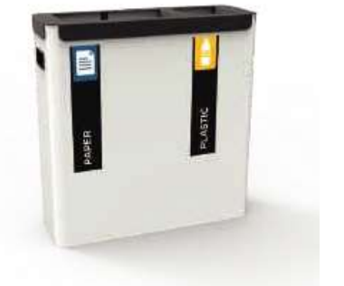
MAKİ 60 Two Compartment Metal Waste Bin Material: Electrostatic Painted Metal Capacity: 75 Lt Capacity with Inner Bucket: 60 Lt Width x Depth x Height 64 x 23 x 68 cm