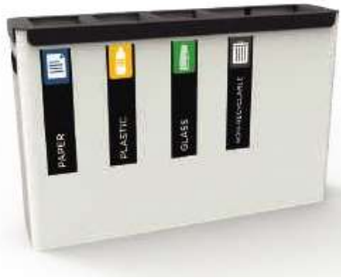
MAKİ 100 Four Compartment Metal Waste Bin Material: Electrostatic Painted Metal Capacity: 125 Lt Capacity with Inner Bucket: 100 Lt Width x Depth x Height 101 x 23 x 68 cm