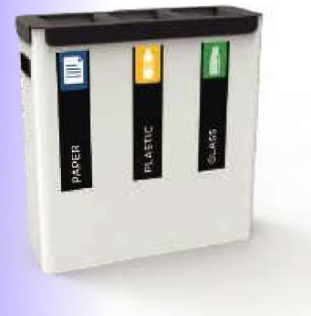
MAKİ 60 Three Compartment Metal Waste Bin Material: Electrostatic Painted Metal Capacity: 75 Lt Capacity with Inner Bucket: 60 Lt Width x Depth x Height 64 x 23 x 68 cm