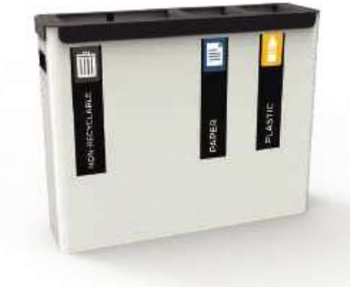
MAKİ 80 Three Compartment Metal Waste Bin Material: Electrostatic Painted Metal Capacity: 120 Lt Capacity with Inner Bucket: 80 Lt Width x Depth x Height 82 x 23 x 68 cm