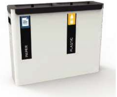
MAKİ 80 Two Compartment Metal Waste Bin Material: Electrostatic Painted Metal Capacity: 120 Lt Capacity with Inner Bucket: 80 Lt Width x Depth x Height 82 x 23 x 68 cm