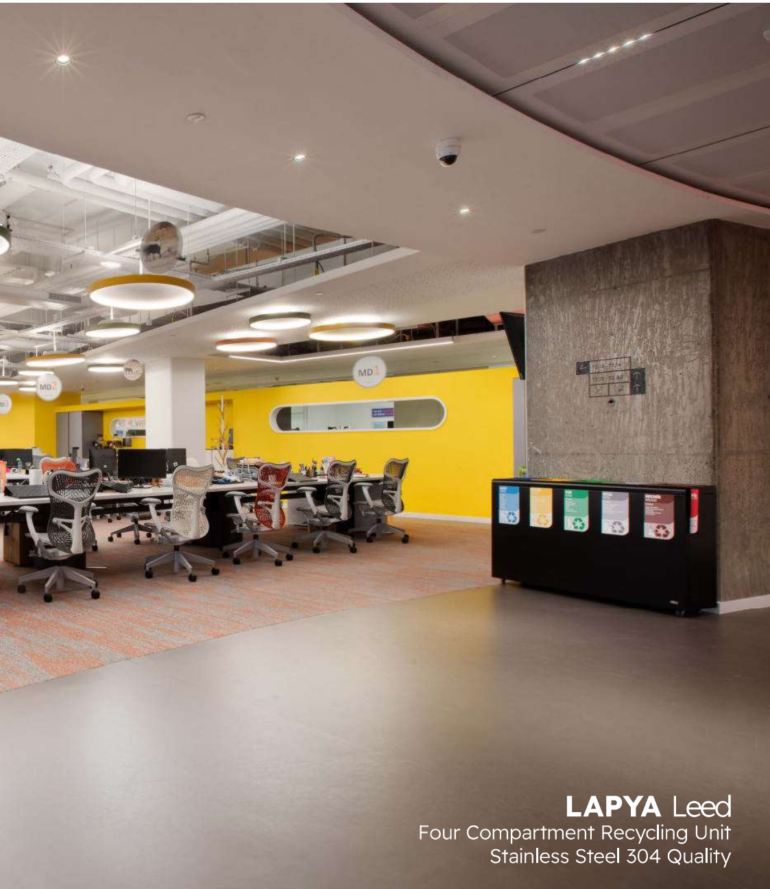
LAPYA Leed Four Compartment Recycling Unit Stainless Steel 304 Quality