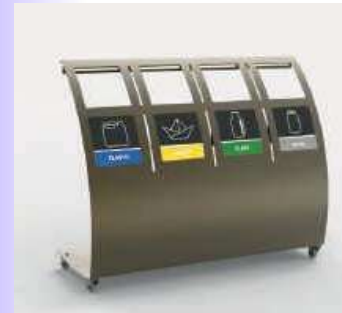
GREENBIN TETRA OPEN Four Compartment Recycling Unit Material: Electrostatic Painted Metal Capacity: 200 Lt Width x Depth x Height 115x 35 x 90 cm