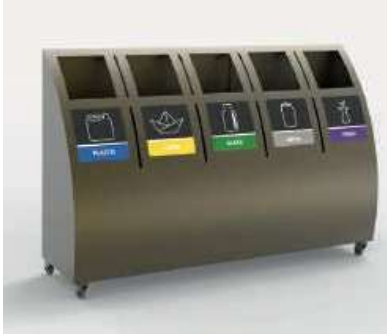
GREENBIN ZERO WASTE Six Compartment Recycling Unit Material: Electrostatic Painted Metal Capacity: 250 Lt Width x Depth x Height 140 x 35 x 90 cm