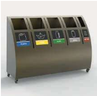
GREENBIN ZERO WASTE WITH BATTERY Six Compartment Recycling Unit Material: Electrostatic Painted Metal Capacity: 210 Lt Width x Depth x Height 132 x 35 x 90 cm