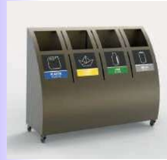
GREENBIN TETRA Four Compartment Recycling Unit Material: Electrostatic Painted Metal Capacity: 200 Lt Width x Depth x Height 115 x 35 x 90 cm