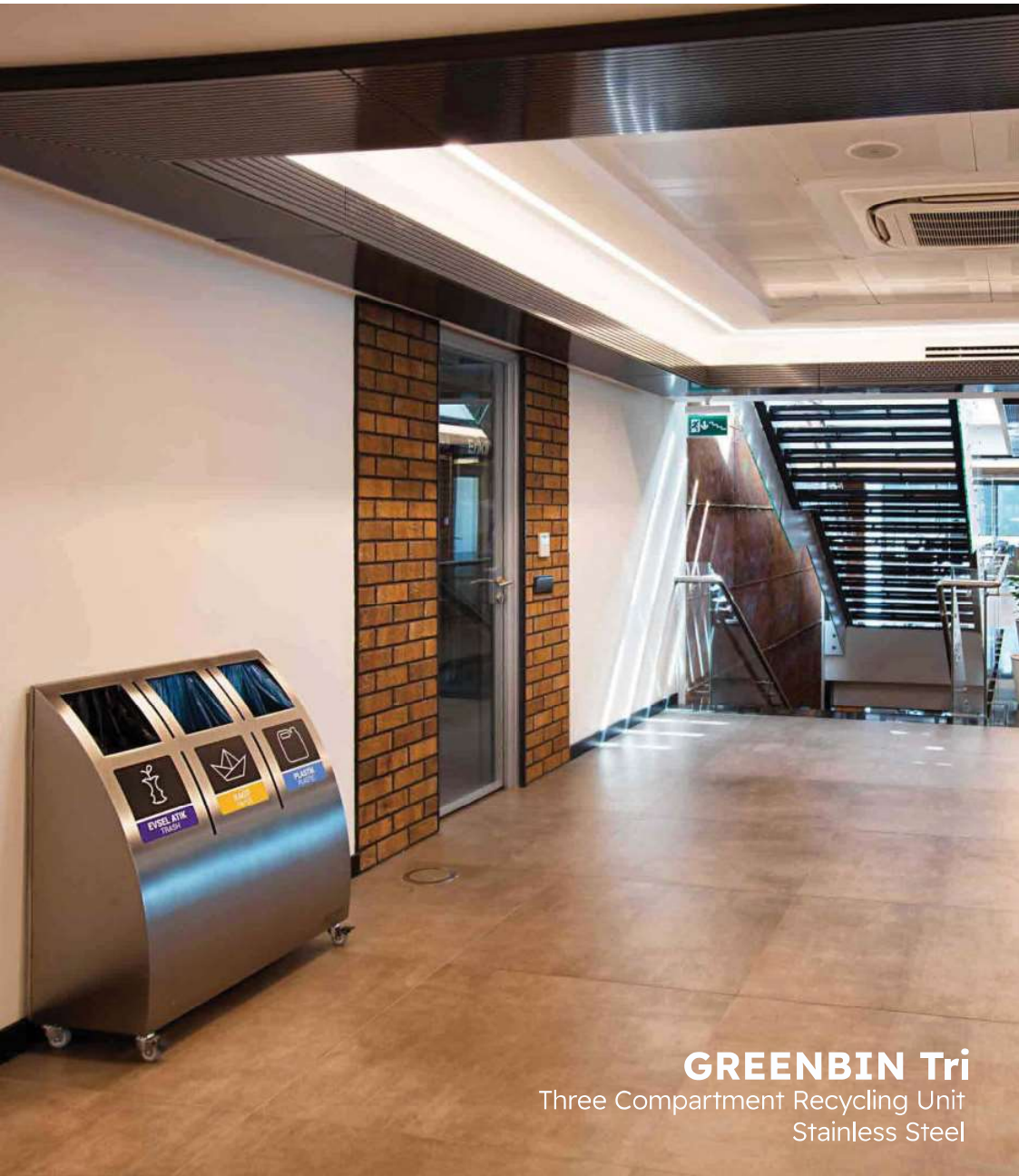
GREENBIN Tri Three Compartment Recycling Unit Stainless Steel