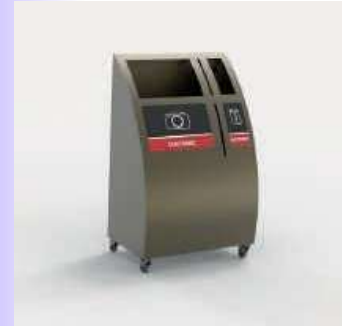
GREENBIN ELECTRONIC Two Compartment Recycling Unit Material: Electrostatic Painted Metal Capacity: 90 Lt Width x Depth x Height 56 x 35 x 90 cm