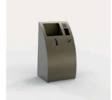
GREENBIN SMOKE Two Compartment Recycling Unit Material: Electrostatic Painted Metal Capacity: 80 Lt Width x Depth x Height 50 x 35 x 90 cm