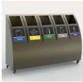
GREENBIN LEED Five Compartment Recycling Unit Material: Electrostatic Painted Metal Capacity: 250 Lt Width x Depth x Height 140 x 35 x 90 cm