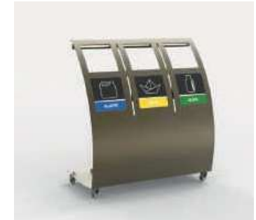
GREENBIN TRI OPEN Tri Compartment Recycling Unit Material: Electrostatic Painted Metal Capacity: 150 Lt Width x Depth x Height 86x 35 x 90 cm