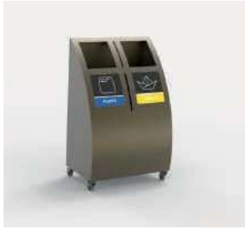
GREENBIN DUO Duo Compartment Recycling Unit Material: Electrostatic Painted Metal Capacity: 100 Lt Width x Depth x Height 56 x 35 x 90 cm