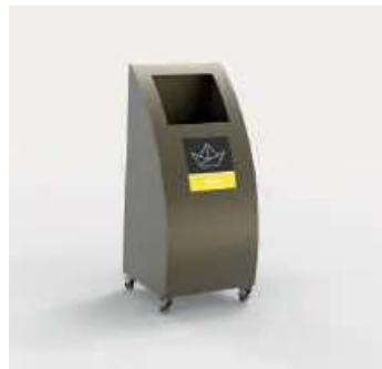
GREENBIN MONO LARGE One Compartment Recycling Unit Material: Electrostatic Painted Metal Capacity: 70 Lt Width x Depth x Height 40 x 35 x 90 cm