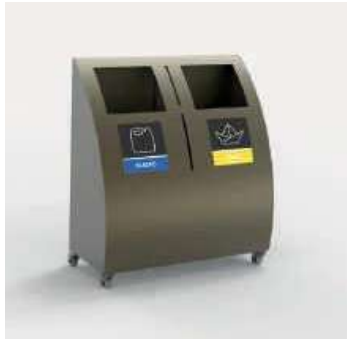
GREENBIN DUO LARGE Duo Compartment Recycling Unit Material: Electrostatic Painted Metal Capacity: 140 Lt Width x Depth x Height 80 x 35 x 90 cm