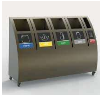
GREENBIN LEED WITH BATTERY Five Compartment Recycling Unit Material: Electrostatic Painted Metal Capacity: 210 Lt Width x Depth x Height 132 x 35 x 90 cm