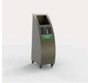
GREENBIN MONO One Compartment Recycling Unit Material: Electrostatic Painted Metal Capacity: 50 Lt Width x Depth x Height 28 x 35 x 90 cm