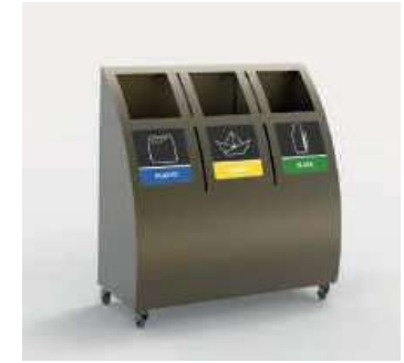
GREENBIN TRI Tri Compartment Recycling Unit Material: Electrostatic Painted Metal Capacity: 150 Lt Width x Depth x Height 86 x 35 x 90 cm